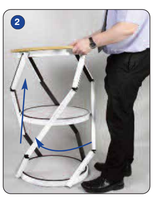
Continue to lift and rotate.