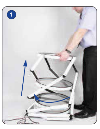
Lift up and rotate the tower clockwise.