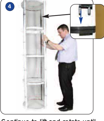
Continue to lift and rotate until the Tower is assembled. Push down each locating clip to secure.