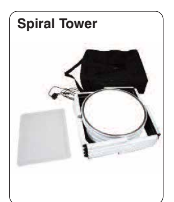
Kit includes: Spiral Tower, 16 x clear acetate panels 1 x carry bag