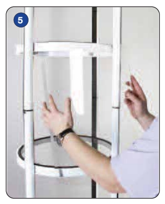
Fit each panel into the Tower