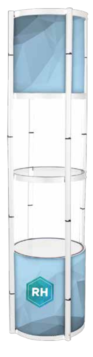
Spiral Tower (NB Graphics are not supplied, Optional graphics available)

Portable collapsible display cases that assemble in seconds without the need for tools.