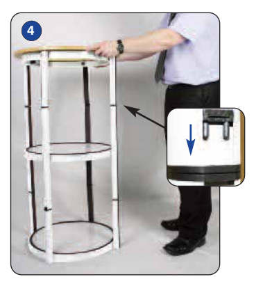
Continue to lift and rotate until the Plinth is assembled. Push down each locating clip to secure.