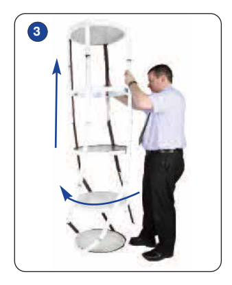
As the Tower assembles ensure each post becomes vertical