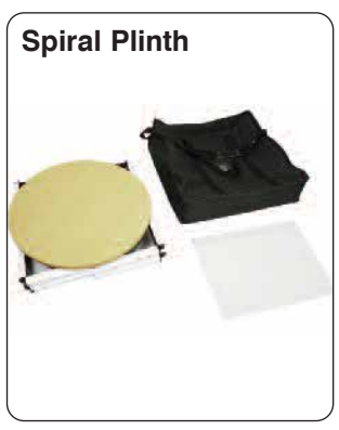
Kit includes: Spiral Plinth 8 x clear acetate panels, 1 x carry bag