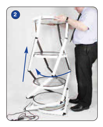
Continue to lift and rotate.