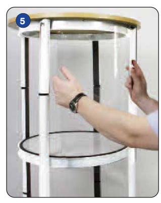
Fit each panel into the Tower