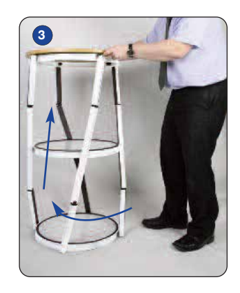
As the Plinth assembles ensure each post becomes vertical and is locked into place.