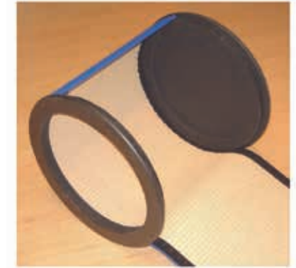
Fit the top to the wrap