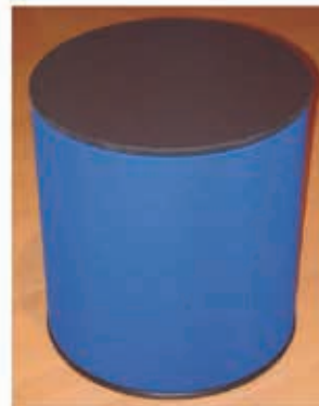
Finally fit the remainder of the wrap to complete the unit