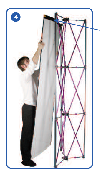
locate the hooks on the hanger to each node and hook into place. In order to position the panels correctly, once hooked at the top, line up the panel edges half way across the magnetic bars.Once fitted the panels may need slight adjustment to line up perfectly