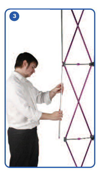
Attach the magnetic bars to the pop-up frame nodes