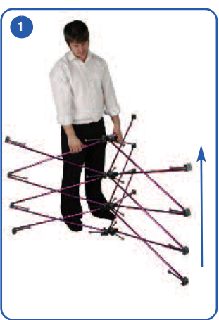
Lift the top of the pop-up frame to expand the structure ensure the nodes are at the top of the structure