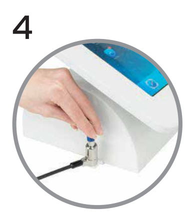
Rotate key through 90° to lock.