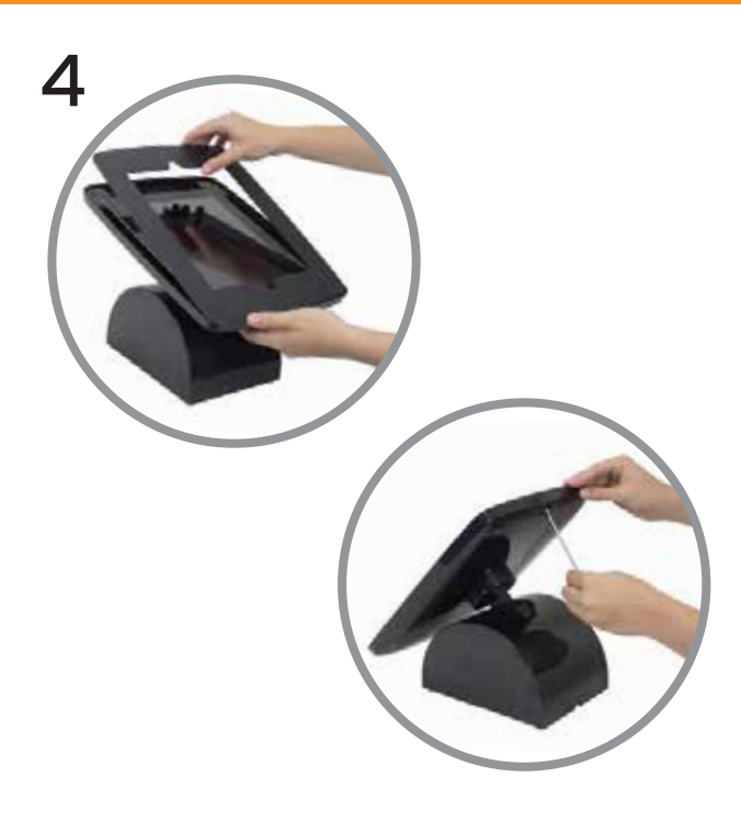
Replace fascia, re-insert and tighten security screw to secure.

If applicable, plug charge/sync cable into tablet. Place tablet inside enclosure ensuring it is centrally positioned within the relevant corner mouldings.