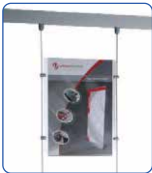
A4 literature holders

Provides a high quality and cost effective solution for displaying literature. This attractive unobtrusive stand is ideal for travel and estate agents display