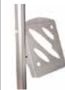
Linear literature holder LN112