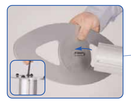
Attach base to male post using M10 bolt and allen key. Ensure clear washer is between base & post. Repeat step for 2nd post.