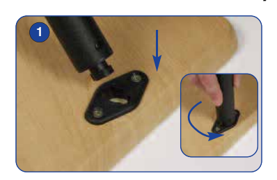
To attach the internal shelf insert the twist and lock pole into the locator on the shelf