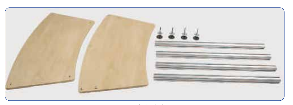
Kit includes: 1x table top, 1x base, 4x linear 50mm round post, 4x adjustble feet, 6x wing extrusion