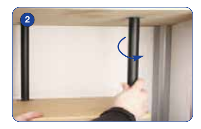
Lift the internal shelf to the shelf locator on the base side of the table top. Twist each pole into place until fully secure