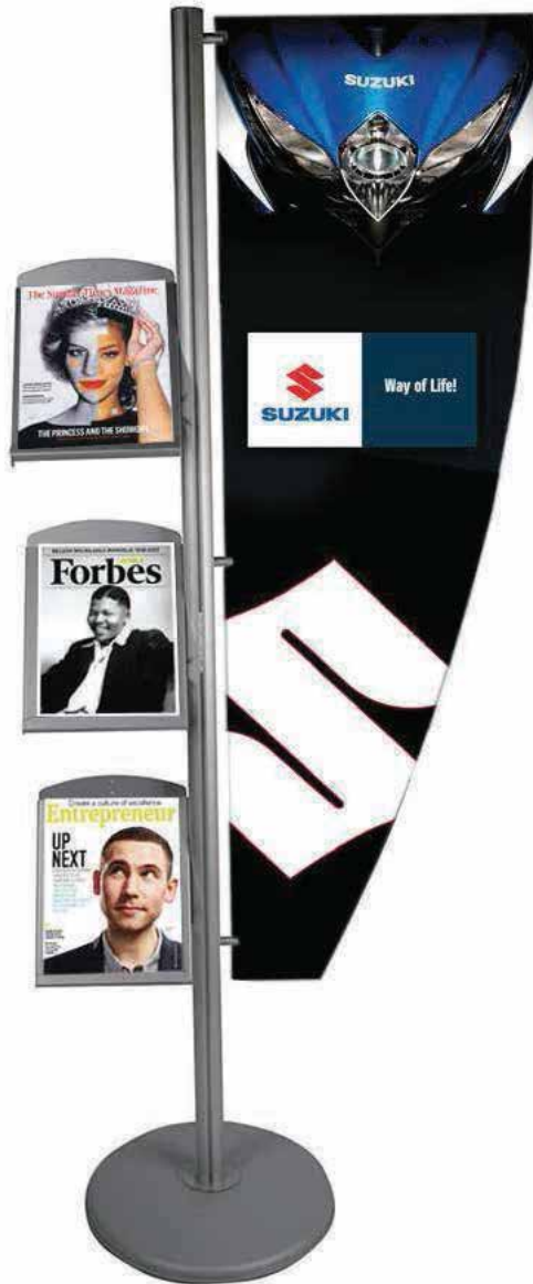
Graphics are not supplied

A linear graphic and literature post, great for demonstration and exhibition environments, an ideal solution for displaying information