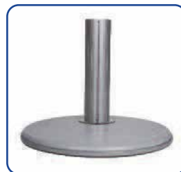
450mm dia Steel dome extra cost option (weight 7.5kg approx) Recommended carry bag: LPB