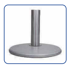
450mm dia Steel dome extra cost option (weight 7.5kg approx) Recommended carry bag: LPB