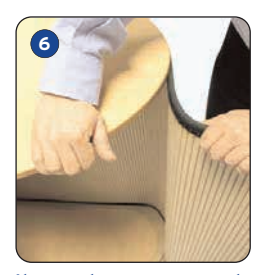
It may be necessary to open some of the wrap to fit the top onto the hook fastener.