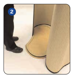
Make sure that the hook fastener on both the tambour and base fit securely together.