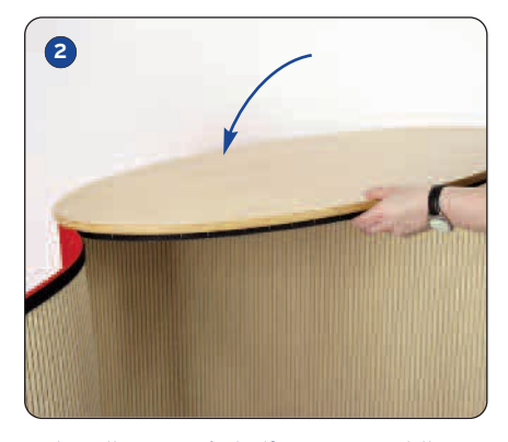
When the wrap is half way around the base, place the top (B) carefully on, securing it against the hook fastener strip on the wrap.