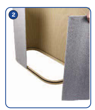
Continue to attach the wrap around the base until fully attached