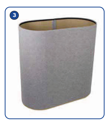
Once the wrap is fully attached make sure that the wrap is butted up against each other to make a seamless join