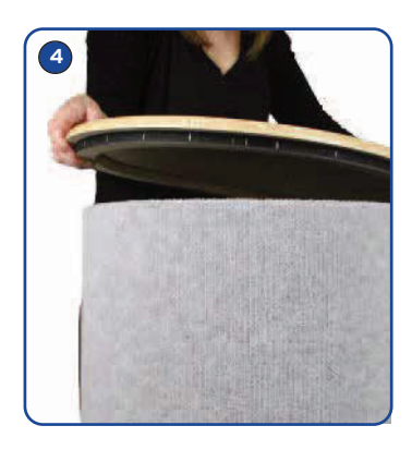
To attach the top simply lower the top into place and make sure that the hook and loop is attached all the way around