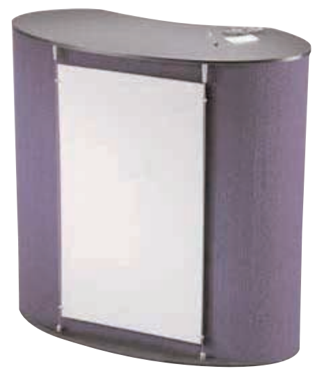
Graphic panel not included