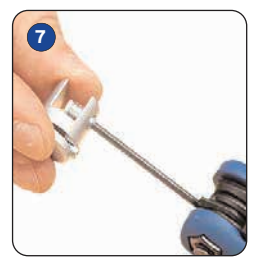
Using a 2.5mm Allen clamping screw in each Poster support.