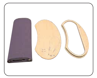
Kit includes: Top, Base, tambour wrap, Wire kits (x2) and Poster supports (x4)