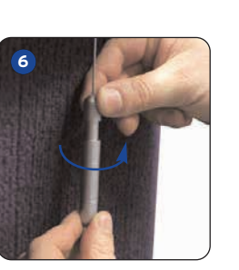
Turn the wire adjuster to pull the wire kits into tension.